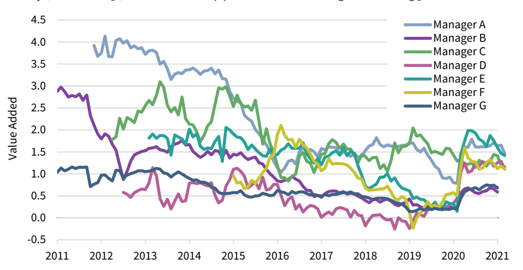
FIGURE 2 ALPHA GENERATION STRATEGIES FOR FIXED INCOME MANAGERS CAN VARY January 1, 2011 – March 31, 2021 • Value-Added (%) Relatvie to BBG Barc Long Credit • Rolling 3-Yr Period • USD Terms

Sources: Bloomberg Index Services Limited and Cambridge Associates LLC. Note: Data for each manager begin with the first year available.